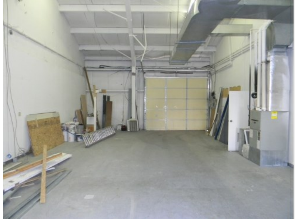
Unit 7/8 - Warehouse Area