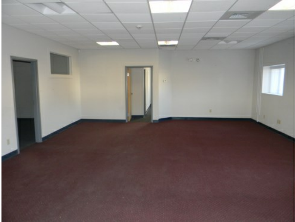
Unit 7/8 - Office Area